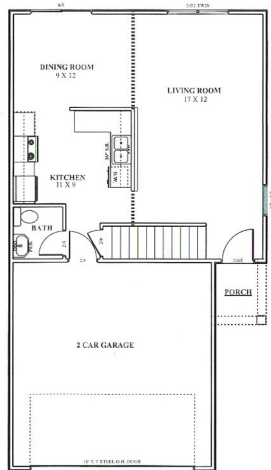
THE "CAMBRIDGE" FLOOR PLAN 1455 SQ. FT.